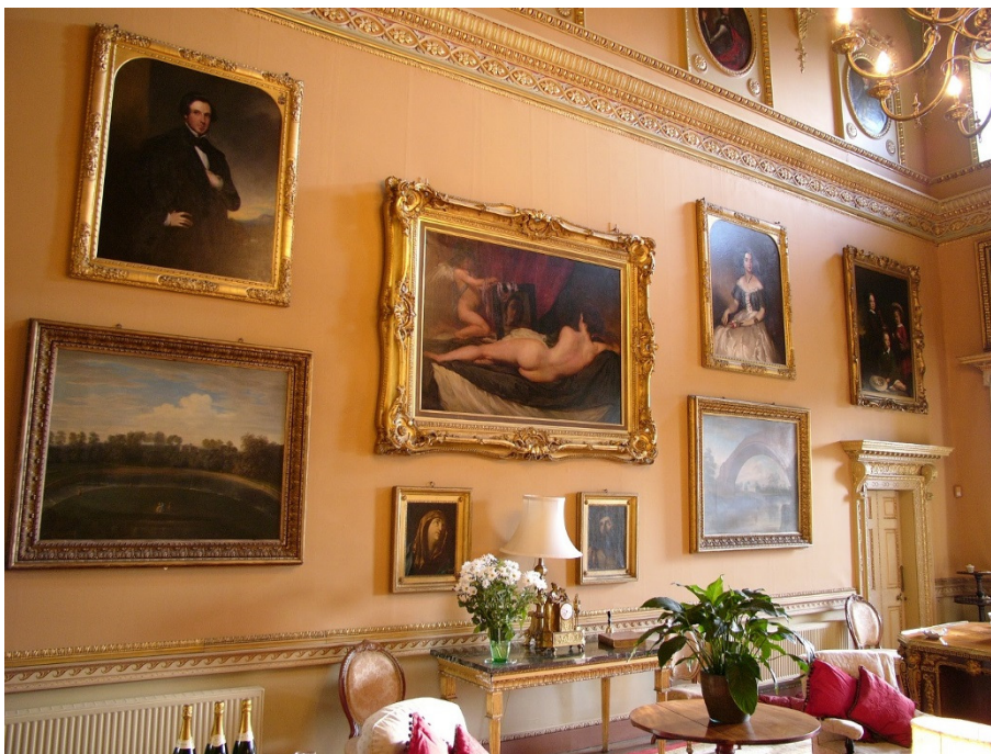
The Saloon at Rokeby, with the copy of the Rokeby Venus