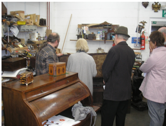
A group being shown the joined chest of 1613

The Golf Club is approached from West Busk Lane and if coming from Otley this is off Bradford Road, second turn right after Kineholme Garage, and admission to the Dining Room is via the Function Room Entrance to the left of the main door as you face the Club House.