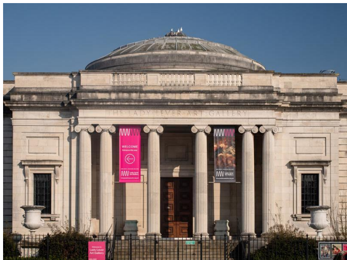
Left: The Lady Lever Art Gallery, Port Sunlight. Below: The Drawing Room, Sudley House.

The cost of this day is £60. This includes coach travel, entry and tours of both venues, but not lunch, which will be taken at the Lady Lever Art Gallery Café. Alternatively, members may use their own cars, in which case the cost is £50. An application form can be found at the end of this Newsletter.