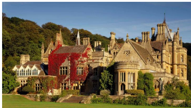
Tyntesfield