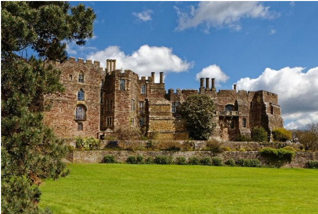
Berkeley Castle

On Monday 22nd we travel by coach from Yorkshire to our rail pick-up point at Cheltenham rail station before driving on to Berkeley Castle in Gloucestershire. Members joining us by car are advised to meet us here. Here we will enjoy a guided tour of Berkeley Castle, the ancestral seat of the Berkeley family since the 12 th century. The castle remains an impressive medieval fortress but it is also a family home replete with fine furniture and paintings, family heirlooms and historic relics. Splendid terraces and walks surround the castle, some of which were laid out by Gertrude Jekyll. From Berkeley we will travel on to our Devon hotel, arriving in time to settle in before dinner.