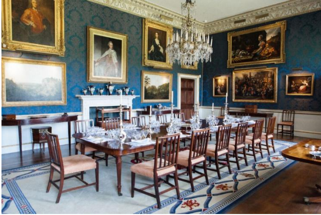
Ugbrooke, the Dining Room

paintings, furniture and ceramics. The adjacent St Cyprian's Chapel was, unusually, rededicated in the Catholic faith in 1673 and is now a parish church for the region's Roman Catholics.