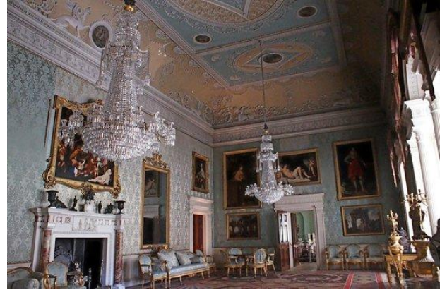
Saltram House, the Saloon