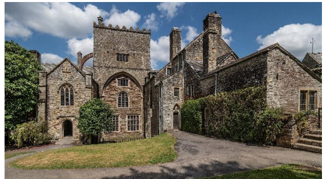
Buckland Abbey

From Saltram we drive to Buckland Abbey for a light lunch followed by a tour. Buckland was originally a Cistercian Abbey, founded in 1278. After the Dissolution it became a private house, with the former church being reused as domestic accommodation. In 1581 it was acquired by Sir Francis Drake, among others, and it remained in the possession of his descendants until presented to the National Trust in 1947. As well as its own collections the Abbey houses paintings from Plymouth City Museum and Art Gallery.