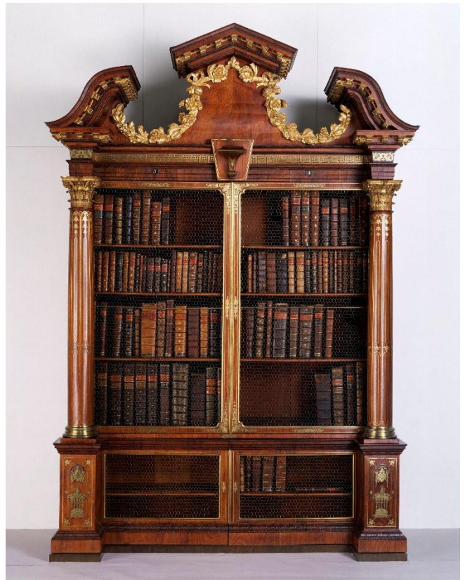
Bookcase, one of a pair made for Powderham Castle by John Channon in 1740

Our final day is Thursday 25 September, when we head for Powderham Castle near Exeter. Powderham is a fortified manor house built about 1391 for Sir Philip Courtney, whose ancestors have lived there ever since. It is a palimpsest of medieval, Tudor, Georgian and Victorian phases. There are some fine 18 th century interiors with plasterwork, paintings and furniture, including the famous Powderham Bookcases, made in 1740 by the cabinet maker John Channon, who became one of Chippendale's neighbours in St Martin's Lane.